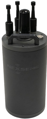
Figure 1: X2-SDLMC Submersible Data Logger.

IMPORTANT - BEFORE FIELD DEPLOYMENT: Completely configure new X2 systems with sensors and a web connection in a nearby work area. Operate the system for several hours and ensure correct sensor readings. Use this test run to become familiar with the features and functions.