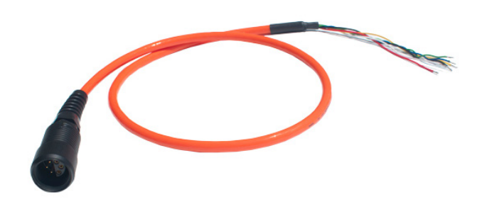
Figure 1: UW6-FLxR Cable Assembly