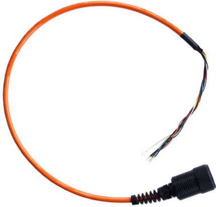
Figure 1: UW-FLxR Cable Assembly.