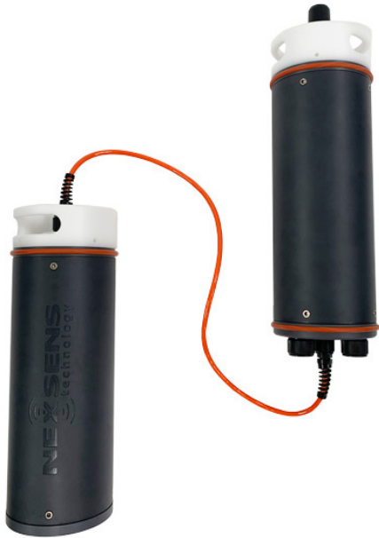
Figure 5: 8-pin to 6-pin plug cable assembly connected between X2-SDL data logger and SBP500.