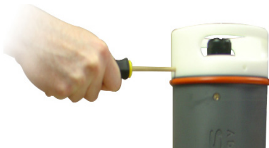
Figure 2: Remove the battery lid at the top of the SBP500.