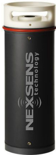
Figure 1: NexSens SBP500 Submersible Battery Pack.