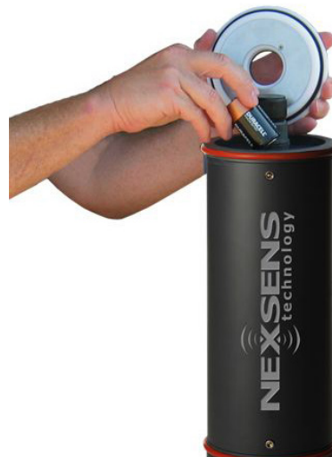
Figure 3: Install the (16) D-Cell batteries into the battery tubes.