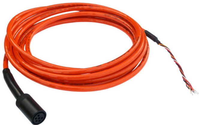
Figure 1: NexSens Cable Assemblies.